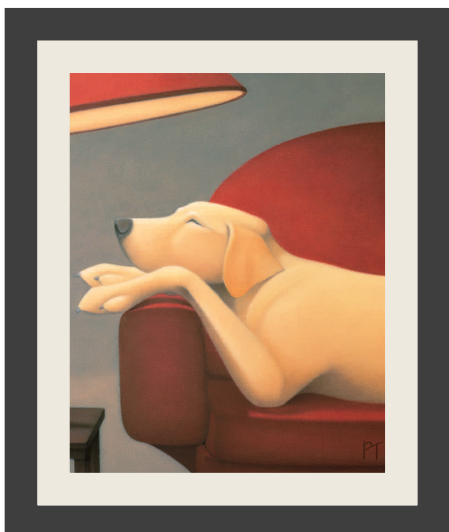
EXPLORER'S CLUB, POLLY THOMPSON

Proper proportion is vital in all good design. The width of the mat border should never be the same as the width of the frame. This draws the eye away from the art. The frame should always be smaller than the mat border. If you own an image you love and the framing design looks like the piece shown below, you will be amazed how great it will look if you just update the framing design!